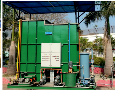
10 m 3 /d skid mounted STP with tertiary treatment for Castrol India Ltd., Mumbai. Year 2015