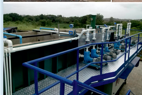
40 m 3 /d ETP for Capital Food Vapi. Year 2016