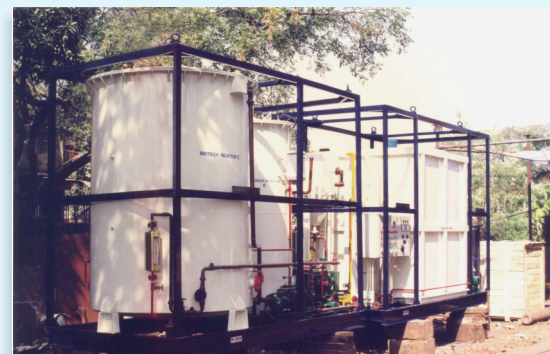
5 m 3 /d ETP for Heng Zing, Paper Mill, China. Year 1998