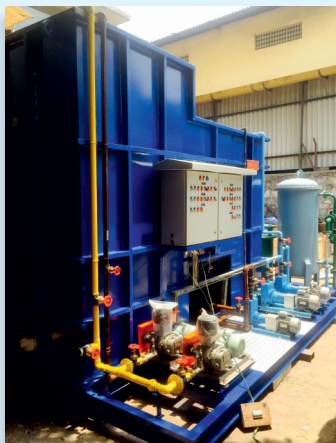
20 m 3 /d STP for Pernod Ricard, Nasik. Year 2014